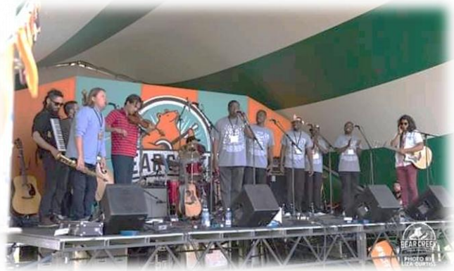
BU sharing song with other International Acts (Bear Creek Festival)Canada