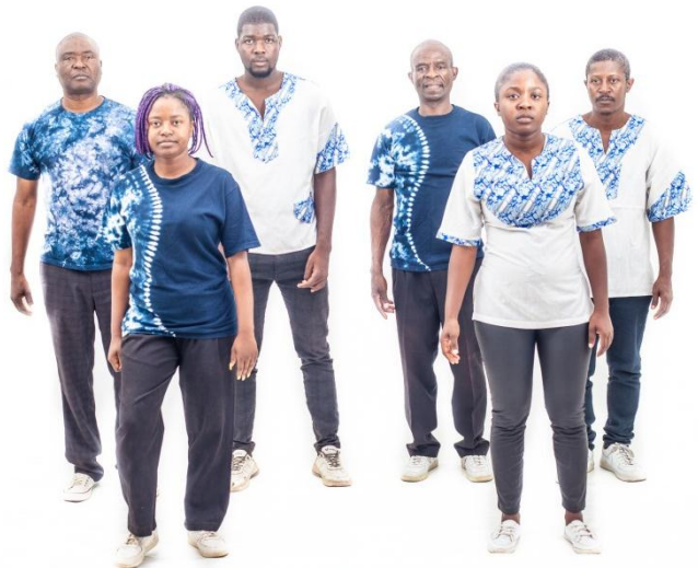
A diversified Black Umfolosi with some youths coming onboard