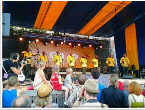
Black Umfolosi afternoon family show in Estonia