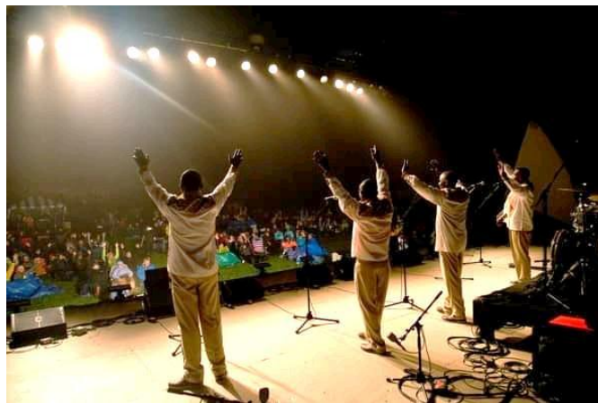
Black Umfolosi live in North Pole (Yellow Knife Canada)