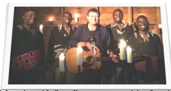
Collaboration with Canadian country musician Lennie Gallant 'Christmas day on planet earth'