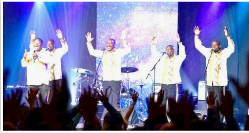
Black Umfolosi live in Rainforest International Festival (Malaysia)